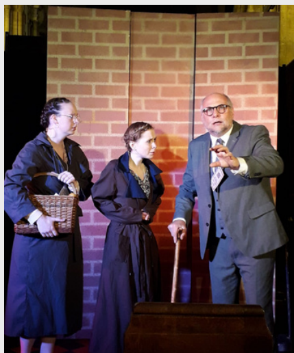
The Hiding Place