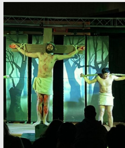
Passion to Pentecost